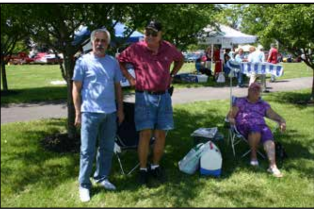
Who are these people?

There is a website that features the original factory brochures for nearly every American car. You can select the manufacturer, the year and the model. You can also look up the miscellaneous section for old advertisements.